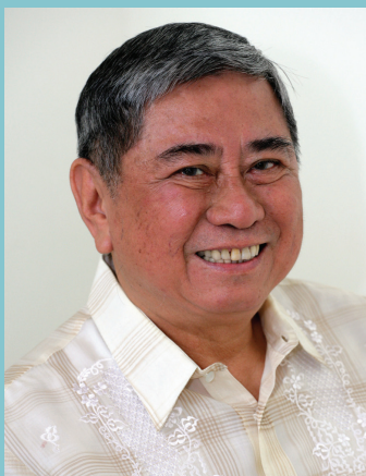
Virgilio S. Almario National Artist for Literature NCCA Chairman